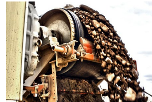
Watch Video 3