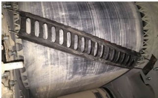
Watch Video 1

Martin Engineering founded more than 70 years, makes bulk materials handling cleaner, safer, and more productive. Martin offers systems to clean conveyor belts, prevent load zone spillage, keep belts on track, control dust at loading zones, and enhance the flow of material from storage vessels and through process equipment.