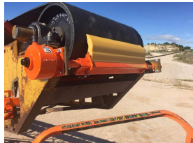
Watch Video 2