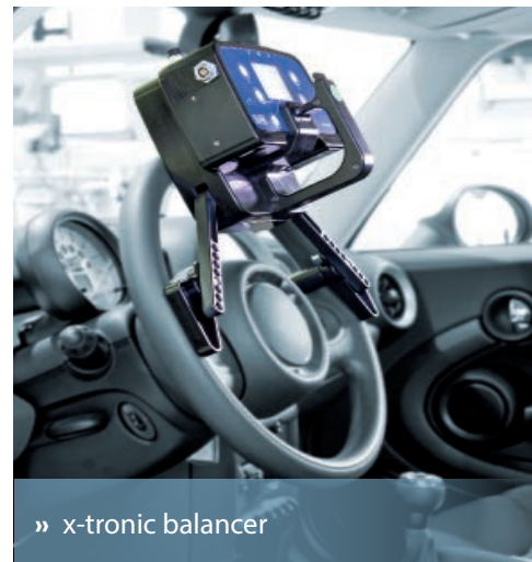
» x-tronic balancer

Using the integrated diagnostics interface of the balancer (option), the test stand PC can do diagnostics tasks and ECU parameter set-up in parallel to the chassis adjustment tasks.